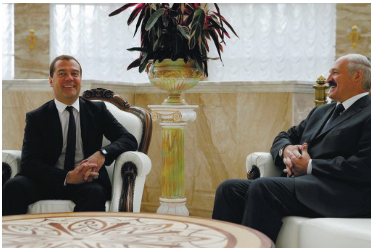
Russian Prime Minister Dmitry Medvedev meet with Belarusian President Alexander Lukashenko

suggested that Moscow would toughen its stance against Japan. In the interview, which comes ahead of Naryshkin's June 2 visit to Japan, he said "dialogue among all the political forces" is the only way to ease tensions, including in Ukraine.