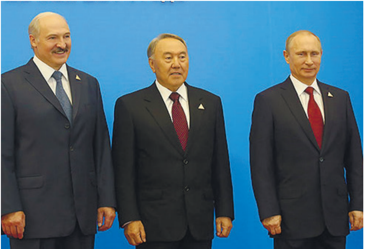
Russia, Belarus, Kazakhstan Sign Eurasian Union Treaty

During President Vladimir Putin's expected visit to Japan this fall, the sides could adopt a joint statement increasing the level of Russian-Japanese cooperation, Naryshkin added. After Japan announced sanctions against Russia in mid-March amid the Ukrainian crisis, many Japanese politicians