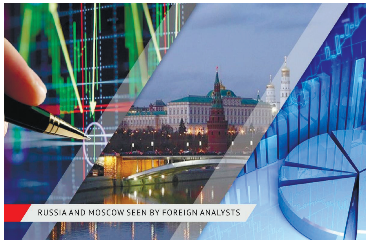
RUSSIA AND MOSCOW SEEN BY FOREIGN ANALYSTS